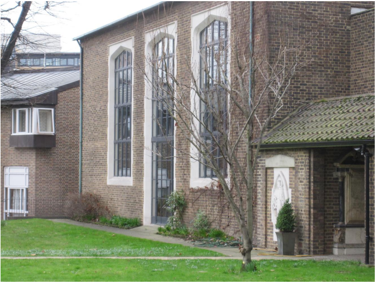
St. Katharine's in London, chapel